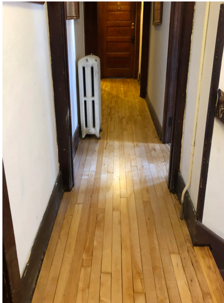
In addition to floor refinishing, old carpeting was removed from the chapter office, library, and second and third floor hallways. Photos of the third floor hallway viewed from the front of the house (East) looking back (to the West), before (left) and after (right) removal of carpeting and refinishing of underlying floor. View more photos online at our site: http://daa.khk.org

In addition to the major project of floor refinishing, smaller improvements were also made around the house, including repainting of rooms 24 and 34, repairing locks, and replacing stair floor protectors. Thanks to everyone involved in helping with these tasks.