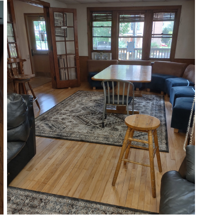
Photographs of the living room floor before (left) and after (right) refinishing. The old finish was badly worn, with areas of bare wood showing through. New area rugs were also purchased by DAA, as well as protective felt pads on furniture and chairs, and rubber wheels on rolling chairs to protect the floors from scratches and excessive wear. More photos of the floor project can be viewed on our website at http://daa.khk.org