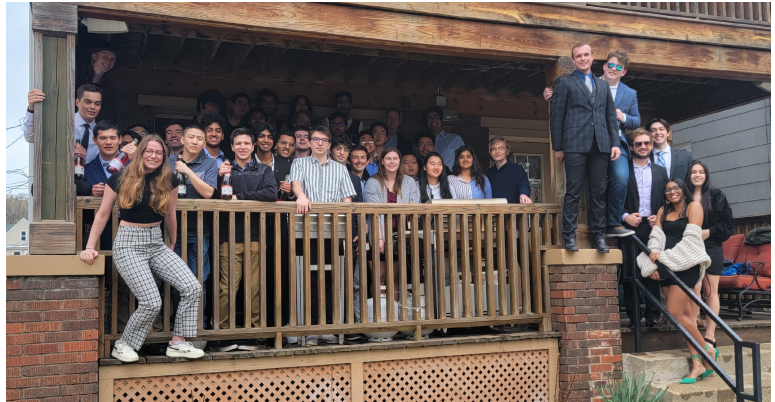
The entire Delta Chapter at the last banquet in Spring 2022 after initiating a new active class of 14. The banquet was held at The Great Dane Pub & Brewing Company.