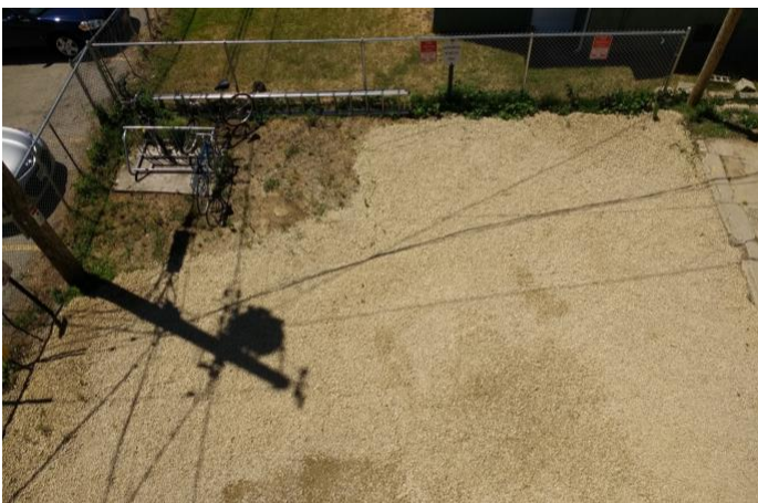
A view from above of the Chapter House back parking lot, resurfaced with a fresh layer of gravel. Please visit our web site to see more photos: http://daa.khk.org

The DHC also replaced the chapter's dishwasher with a new GE Adora unit, with the cost split equally between the Housing Corporation and active chapter. The DHC holds a weekly meeting on Zoom during the summer to review ongoing projects, discuss future projects, and keep everyone updated on the state of the house. Meetings are held at 7 pm on Mondays, and all are welcome to join.