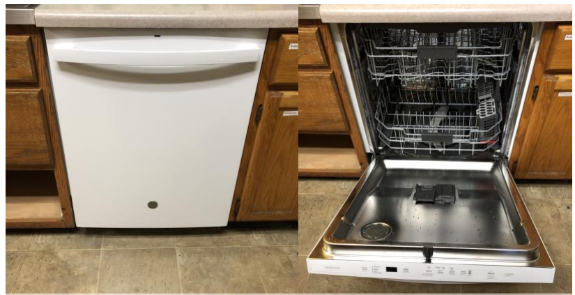
Newly installed GE Adora dishwasher in the Chapter House kitchen, to replace the old non-functional and leaking dishwasher. Thanks to DAA officers Roy Rasmussen and Jerry Peplinski for their help installing the dishwasher. The cost for the unit was split equally between the DHC and active chapter.

The DHC maintains a list of major projects that may come up in the future, including refinishing all of the wood floors in the house, with removal of carpet in the hallways, chapter office, and room carpet to expose the wood floor for refinishing, with an estimated cost of $4,000 - $12,000 (depending on scope); installation of a whole-house sprinkler system for fire suppression, with an estimated cost of around $80,000; replacing all windows in the house, estimated at $68,000 (depending on the quality of the windows) with the addition of permanently installed air conditioner units, estimated at an additional cost of $20,000. Your donations to the House Improvement fund will help us perform this important work.