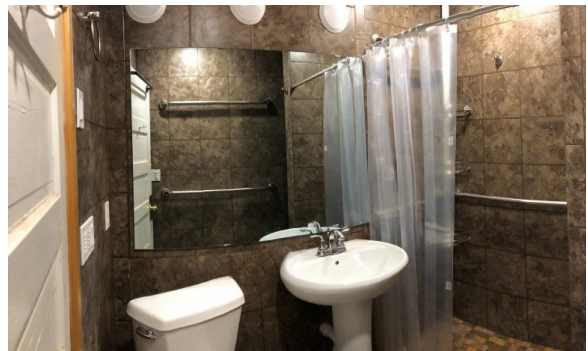
A panoramic view of the new 3 rd Floor Bathroom, featuring new fixtures and floor-to-ceiling tile.

Finally, in a major undertaking, the third floor bathroom was completely demolished and rebuilt with floor to ceiling ceramic tiles, updated plumbing fixtures, motion sensor lighting and new handrailing and fixtures for improved usability and accessibility. Water supply pipes were removed from the wall and replaced with modern PEX plumbing due to a restricted hot water supply. A fan system with a more powerful blower was installed in the attic, serving both 2 nd and 3 rd floor bathrooms. The cost for rebuilding the bathroom was approximately $37,000