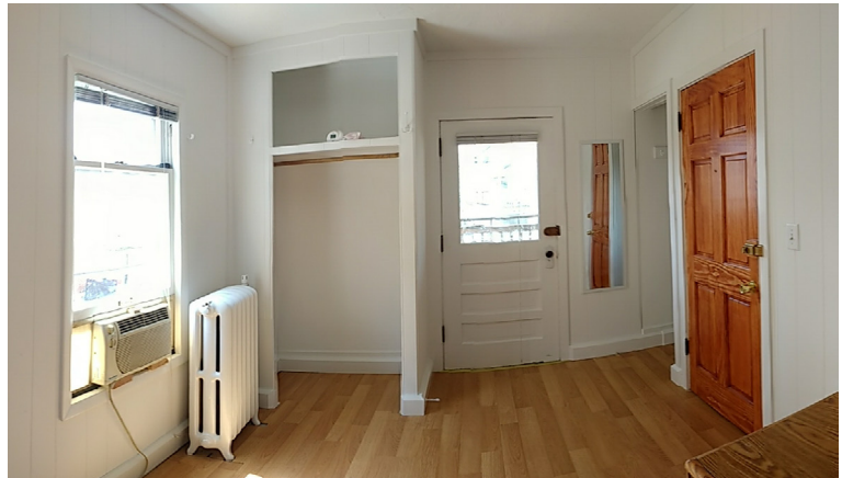
Room 24 renovations, including a new door and lockset to replace the damaged door, mirror, and baseboards.

Major projects in the future include refinishing all of the wood floors in the house, including removing hallway carpet and some room carpet to expose the wood floor for refinishing, with an estimated cost of around $10,000. Installation of a whole-house sprinkler system for fire suppression, with an estimated cost of around $80,000. Replace all windows in the house, estimated at $68,000 (depending on the quality of the windows) with the addition of permanently installed air conditioner units, estimated at an additional cost of $20,000. Your donations to the House Improvement fund will help us perform these improvements to the house.