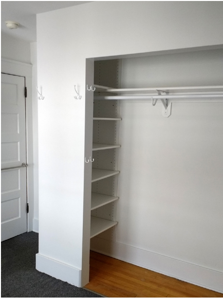
Room 35 renovations, including new closets and storage space designed and built by our contractor.

With another summer of low rental occupancy during summer, significant renovation to rooms was once again done, with the goal of all rented rooms renovated by the end of next summer (2020). This summer, work on rooms 24, 25, 26, 34, 35 and 36 included, as needed, replacement of baseboard, painting, installation of fixtures such as mirrors, closet rods and hangers, new electrical outlets, and upgraded electrical feeds for air conditioning. These renovations were paid for with DHC funds, thanks to the generous donation of the estate of Steve Paugh. It is the ongoing mission of the DHC to bring the rooms in the house up to a standard of living equal to or better than comparable rental options in the area.