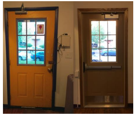
Comparison of old (left) and new (right) front door interior and RFID entry system. The doors now swing outwards and have push bar openers for added safety.

This summer was marked by many capital improvements to the house, the most visible of which is the replacement of the front and back doors to the house for $6,265 and the installation of an RFID entry system for $1,343.89 (see photo). Come check out our new doors at homecoming! If any local alumni would like access to help out around the house, please contact Jerry Peplinski or Sam Hurley for details. We can provide a key fob. In addition to doors, another major capital improvement was the much-needed replacement of hot water radiator flow and bleed valves, at the cost of $9,845. Many of the valves at the house were leaking or could not be fully shut off. Rooms were upgraded to valves with integrated thermostats, and standard valves were placed in the common areas (see photo).