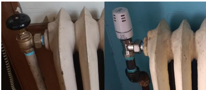
Example of standard (left) and thermostatic (right) radiator valves that were replaced this summer.

Due to low rental occupancy during summer, the opportunity was taken to do significant renovation to rooms and the second floor bathroom in the house for a total of $15,075. Work on rooms 21, 22, 25, and 37 included replacement trim, painting, installation of fixtures such as mirrors, closet rods and hangers, new networking and electrical outlets, and upgraded electrical feed for air conditioning. Water damage in the 2 nd floor bathroom was repaired, and renovations included new drywall, fixtures, shelves, and paint. It is the ongoing mission of the DHC to bring the rooms in the house up to a standard of living equal to or better than comparable rental options in the area.