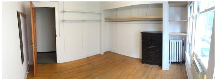
Example of renovations and improvements done to Room 22

Major projects in the future include refinishing all of the wood floors in the house, including removing hallway carpet and some room carpet to expose the wood floor for refinishing, with an estimated cost of around $10,000. Installation of a whole-house sprinkler system for fire suppression, with an estimated cost of around $80,000.