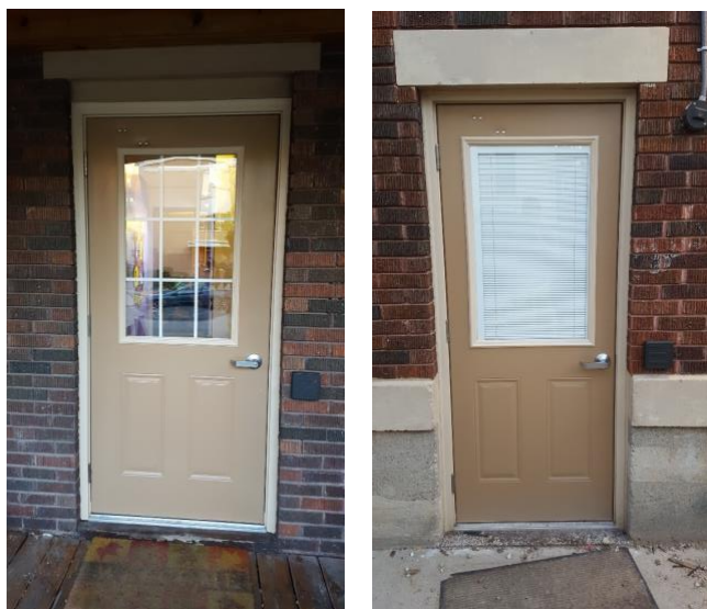
Above: The new front door (left) and rear door (right). RFID scanners can be found to the right of both doors at a height roughly even with the door handle.

This past summer was filled with numerous improvements to the house. The coordination of these improvements was spearheaded by alumnus Jerry Peplinski. Weekly meetings were held throughout the summer to discuss our own efforts at the house and plan upgrades that required professional assistance. One of the most visible and functional improvements to the house was the replacement of the front and rear exterior doors at the house. As shown below, the new front door is fresh replica of the previous door, but the rear door has changed significantly. It is now equipped with a large window complete with internal blinds. Both doors now open outward with a push bar for greater safety and functionality. In addition, alumnus Sam Hurley redesigned the previous RFID entry system. This system is now functional of both the front and rear exterior doors. The RFID scanners communicate with a central controller that possesses a programmed access list to release the latch on the door frame when an authorized WisCard is presented.