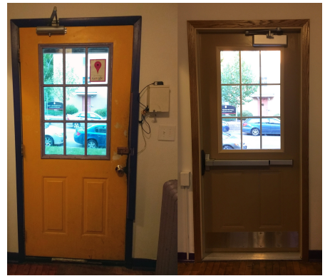
Comparison of old (left) and new (right) front door interior and RFID entry system. The doors now swing outwards and have push bar openers for added safety.

Due to low rental occupancy during summer, the opportunity was taken to do significant renovation to rooms and the second floor bathroom in the house for a total of $15,075. Work on rooms 21, 22, 25, and 37 included replacement