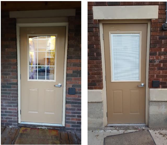
Above: The new front door (left) and rear door (right). RFID scanners can be found to the right of both doors at a height roughly even with the door handle.

This past summer was filled with numerous improvements to the house. The coordination of these improvements was spearheaded by alumnus Jerry Peplinski. Weekly meetings were held throughout the summer to discuss our own efforts at the house and plan upgrades that required professional assistance. One of the most visible and functional improvements to the house was the replacement of the front and rear exterior doors at the house. As shown below, the new front door is fresh replica of the previous door, but the rear door has changed significantly. It is now equipped with a large window complete with internal blinds. Both doors now open outward with a push bar for greater safety and functionality. In addition, alumnus Sam Hurley redesigned the previous RFID entry system. This system is now functional of both the front and rear exterior doors. The RFID scanners communicate with a central controller that possesses a programmed access list to release the latch on the door frame when an authorized WisCard is presented.