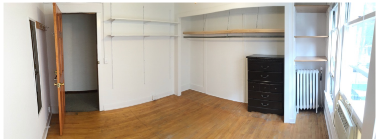
Example of renovations and improvements done to Room 22

Adding permanently installed air conditioner units in the windows (cost unknown). Add cooling and replace hot water heat with a ductless system, estimated between $60,000 and $100,000. Replace all windows in the house, estimated at $22,500 or higher (depending on the quality of the windows). Tuck pointing the brick on the house (no estimate). Your donations to the House Improvement fund will help us perform these improvements to the house.