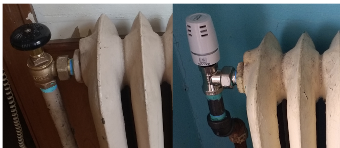
Example of standard (left) and thermostatic (right) radiator valves that were replaced this summer.

trim, painting, installation of fixtures such as mirrors, closet rods and hangers, new networking and electrical outlets, and upgraded electrical feed for air conditioning. Water damage in the 2 nd floor bathroom was repaired, and renovations included new drywall, fixtures, shelves, and paint. It is the ongoing mission of the DHC to bring the rooms in the house up to a standard of living equal to or better than comparable rental options in the area.